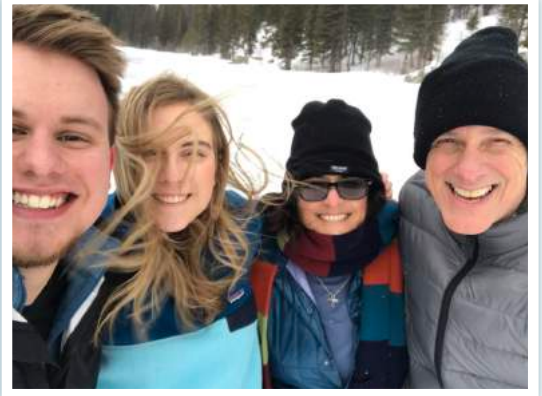
She's going to be our daughter (in-law)!!!

Whirlwind. That word encapsulates February! Family visits, a seminar, meetings, flights, a marriage seminar, a ladies retreat, class/lesson development and delivery, travel guide layouts, and major tour prep all demanded our attention. I think we underestimated the amount of time that preparing for the March Israel tours would add to our quarter at Bear Valley, but it has been exciting to see plans unfold. We leave this Monday, March 5 for two tours – the first with many of the staff and students of Bear Valley; the second with several BV alumni along with Christians coming from AK, TX and CO. We can't wait to be back in the land of the Bible, and to share the experience with friends is the icing on the cake!